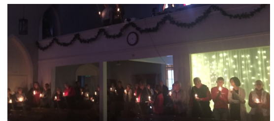
The 'light' is passed and "Silent Night" was sang in preparation for the Holy Night.