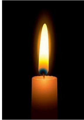
Candlelight Service on Christmas Eve 2019 at McJohnston Chapel was enjoyed by a full church.