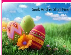
Seek And Ye Shall Find

Easter will be right around the corner after our pancake supper. Please remember that we will be collecting bags of candy instead of having the congregation take empty eggs to stuff. We are also collecting small toys, similar to shoebox toys, to be used as prizes. If you have any questions, please see Shiloh Abner.