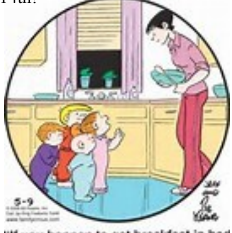
"If you happen to get breakfast in bed tomorrow, Mommy, which is your fave — Sugar Oats or Corny Crinkles?"