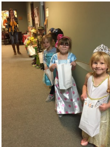
Holiday Parade! What Fun!

It is so difficult to believe that November is here! October was a fun month. We traveled to the McCutchanville fire station. Take a look at that Dalmatian dog at the firehouse. WE also had a Holiday parade around the gym and wore our costumes. Fired Up will be coming to us in November and we will be making Christmas ornaments.