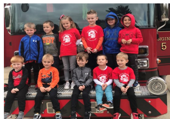
AT the McCutchanville Fire Station